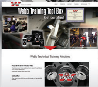
Website Training Toolbox